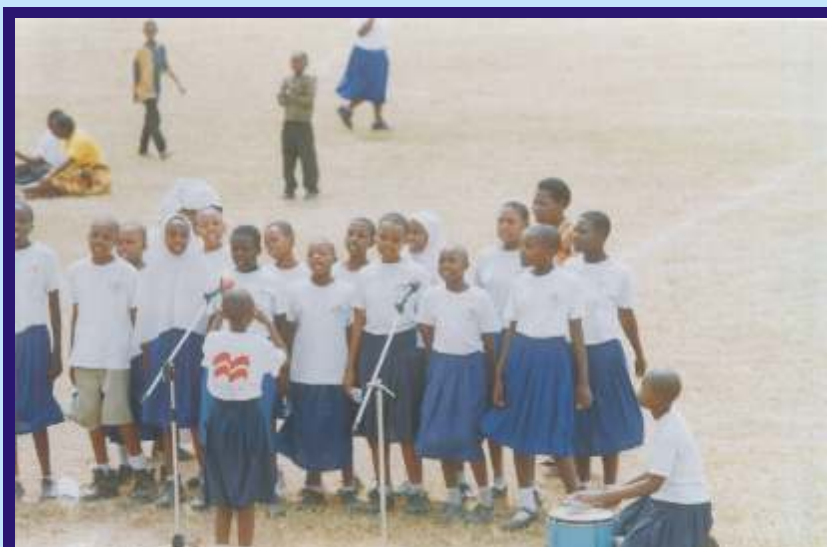
A school choir presenting a song to mark the climax of the African Child Day

Many child activities focused on DAC commemoration, this year the main activities organized to mark the day included;