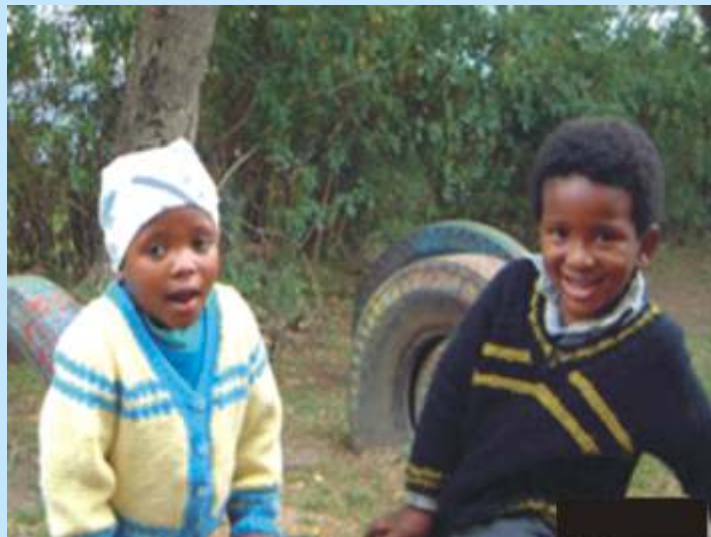
Watoto wenye bashasha wakiwa katika michezo ya kuongeza uelewa wao wa mazingira.

Wakati wa maandamano hayo ya amani maelfu ya vijana wa kike na wakiume walipigwa risasi, na mauaji hayo yalifuatiwa na wiki mbili za maandamano yaliyopinga unyama huo ambapo zaidi ya mamia ya watu waliuwawa na wengine kwa maelfu kujeruhiwa na makaburu. Ili