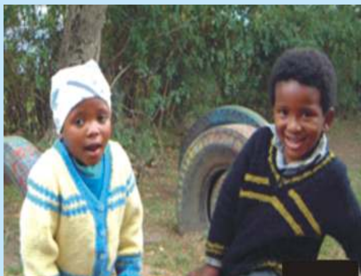
Jovial children play peacefully together in a bid to understand and adapt to their environment.

media coverage as well as providing posters. Equally valuable contributions were the ideas and moral support extended by the rest of the organizing members. The event commemorates the Soweto Killings in South Africa, where thousands of black school children took to the streets in 1976, in a march more than half a mile long, to protest about the inferior quality of education offered then by the Boers and to demand their rights to be taught in their own language.