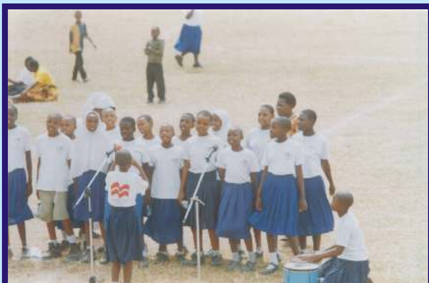
Kwaya ya shule ikiimba katika kilele cha Siku ya Mtoto wa Afrika

Makadirio ya mahema yalikuwa pungufu. Katika nyakati fulani washiriki wengi ilibidi wachomwe na jua kali kwa sababu mahema yalikuwa hayatoshi.