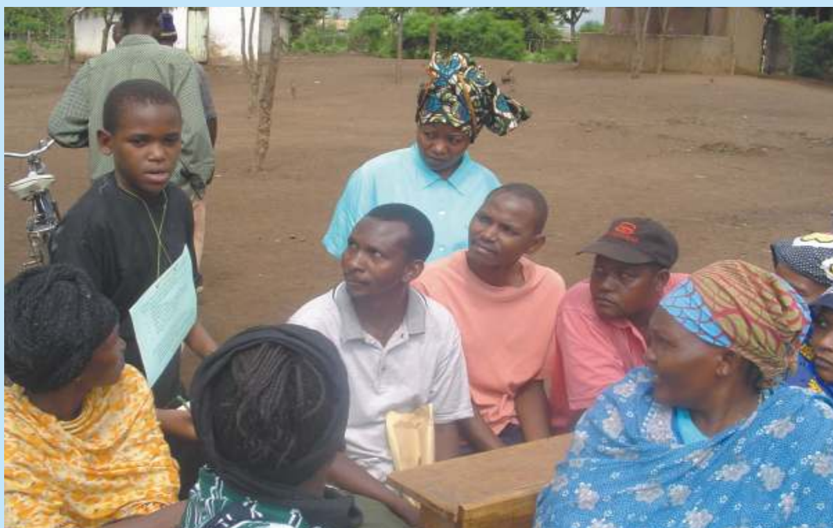
Right to be held: A child appealing to community members to send all children to school on the Day of the African Child

It is from this understanding that the Community Based Rehabilitation (CBR) program from Comprehensive Community Based Rehabilitation (CCBRT) has started collaborating with the Municipal Education Officers, the head teachers and teachers of primary schools and parents, to make education possible for children with disabilities.