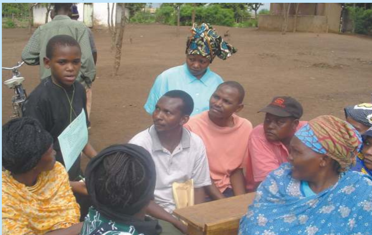
Haki ya kusikilizwa: Mtoto akiwahimiza wanajamii kupaleka watoto wote shule katika kilele cha Siku ya Mtoto wa Afrika

Kutokana na kadhia hii ndio shirika la CCBRT chini ya mradi wake wa kurekebisha jamii wameanza kushirikiana na Afisa Elimu wa manispaa, waalimu wakuu na walimu wa shule za msingi na wazazi, kuwawezesha watoto walemavu kupata elimu.